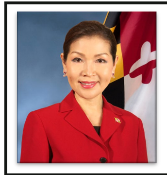
Honored Guest, First Lady of Maryland, Yumi Hogan

LIVE Panel Discussion with Local Experts Resource Tables Interactive Wellness Activities (Music Therapy, Massages, Food, Therapeutic Arts)